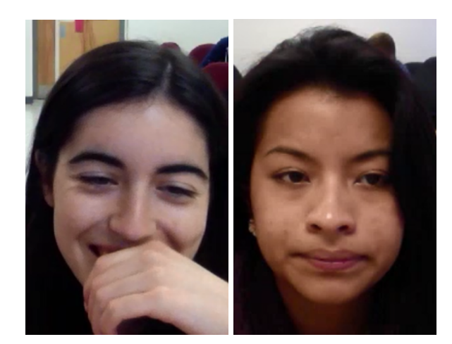
(a) AU6 Cheek Raiser + One Hand to Face