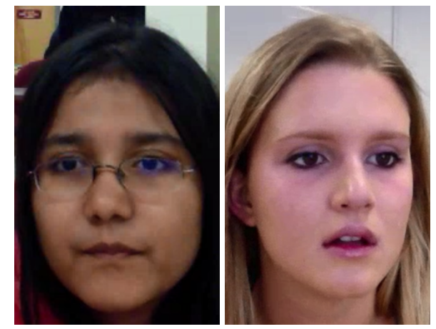
(d) AU24 Lip Pressor