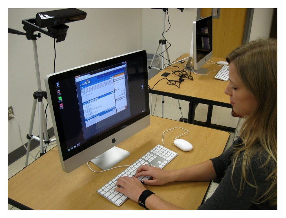
Figure 2: Multimodal instrumented tutoring session, including a Kinect depth camera to detect posture and gesture, a webcam to detect facial expression changes, and a skin conductance bracelet to detect electrodermal activity.

Figure 3: Dialogue excerpt illustrating a tutor inference question in context.