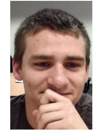
(c) AU10 UPPER LIP RAISER + ONE HAND TO FACE