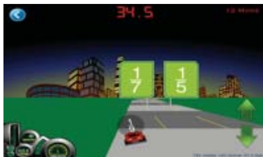
Figure 1. Sample problem: The player's value is 1/9 , and since 1/9 < 1/7 the player moves to the left lane before passing the flags.

Game content and behavior are configurable to allow education researchers, without programming, to rapidly prototype and build a range of experiments. Researchers can, for example, specify number sequences encountered as well as "level" structure that groups similar content together. We support in-game feedback (e.g., text displayed after questions, pausing after incorrect actions for review) via an XML run-time scripting engine.